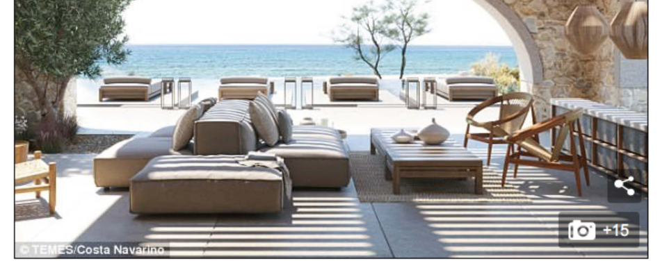
The development's architects and project managers have flown to London and Switzerland to meet buyers to discuss the finishing touches