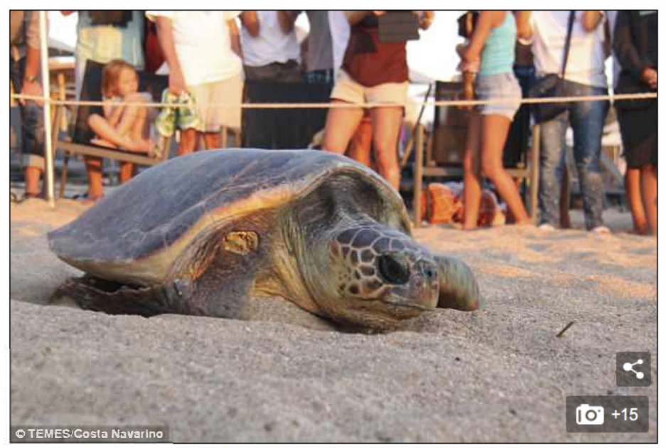
Costa Navarino is an eco-friendly development, taking care to protect the sea turtles that come to nest on the beach