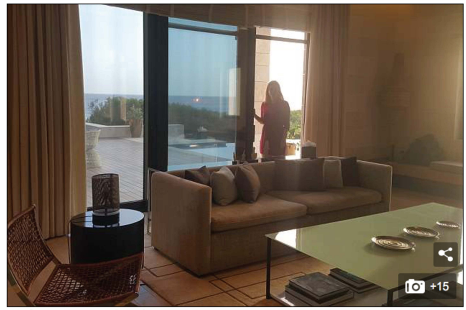
MailOnline Property's Myra Butterworth checks out the Costa Navarino development

Sea turtles can be disorientated by bright lights and so the resort has been built on descending levels as it approaches the beach to avoid harming them. The new houses will follow suite, with the majority being built on one level – something that provides the bonus of uninterrupted views.