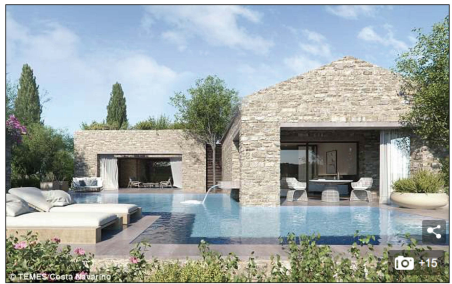
Buyers can fly to the Costa Navarino development from London to Athens via Aegean Airlines with transfers via AugoGreece

The developer Temes has already sold half of the properties off-plan to both domestic and overseas buyers, with prices starting at around £2.3million. Prices can go north of £20million depending on a buyer's requirements for the site, such as infinity pools and basements.