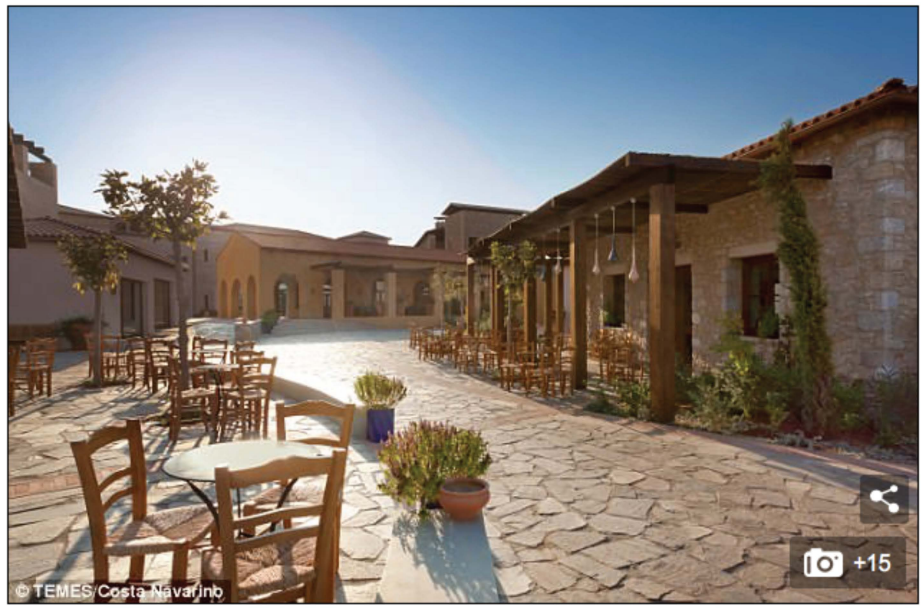
The hotels on the development have several restaurants and bars, along with a spa

'The quality is supreme and you would not find the finish anywhere else in Greece, if not in the Mediterranean.'