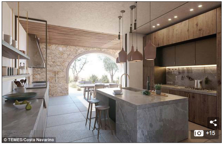
All property prices exclude interior design, furniture and electric appliances in the kitchen

Buyers have the choice of two views - one nestled higher up among the olive groves and the other just 30 metres from the beach.