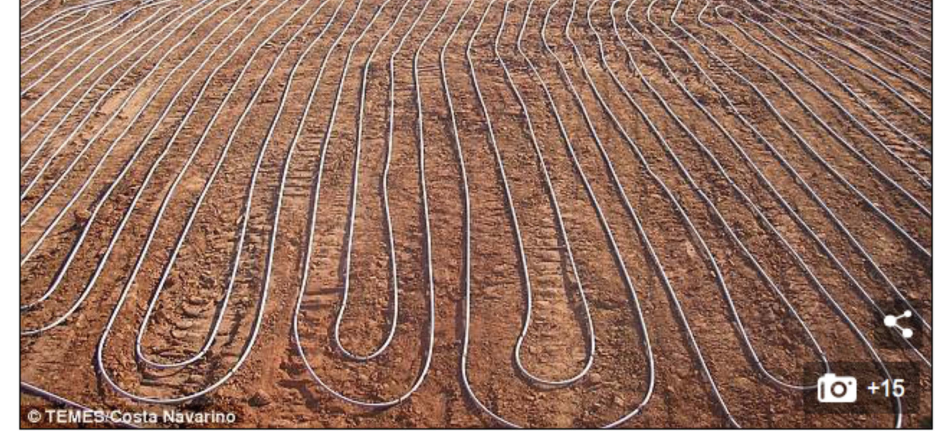
Under one of the golf courses, where there are 123 kilometres of piping carrying water used to heat and cool the site's hotels

One of the big attractions for buyers is access to the resort's two golf courses - with one being more difficult and often used by professional players, with the other being easier and with more beautiful views.