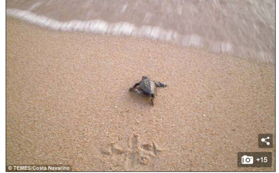
Making a run for it! It's a dangerous first journey to the sea for the baby sea turtles, navigating various obstacles from footprints to driftwood and crabs