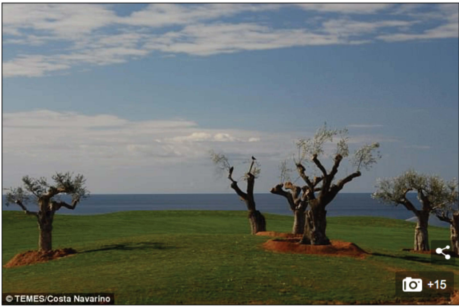
More than 6,000 olive trees have been successfully moved to make way for the new properties