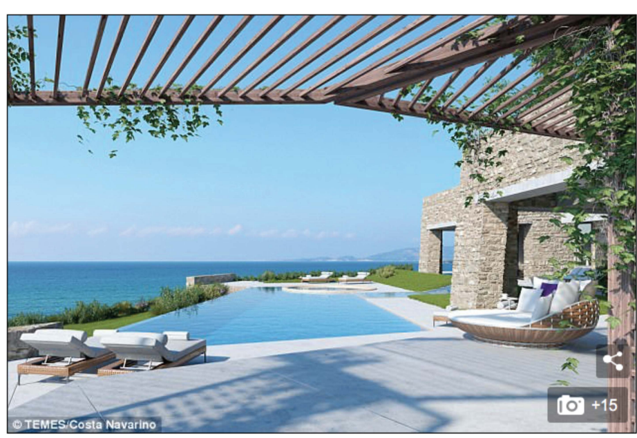
Understated luxury: Designer infinity pools and uninterrupted views of the sea