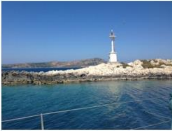
Sailing around the bay of Navarino