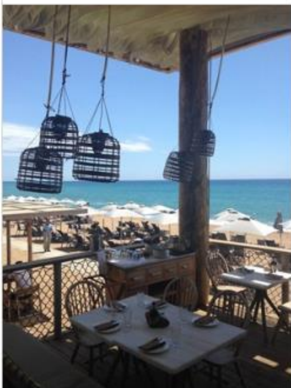
Barbouni restaurant, Navarino Dunes

rates as one of the most beautiful spas we have been to - as well as the one you are most likely to get lost in. It is a veritable maze of sweet-smelling corridors, draped with billowing white cotton curtains, copper lanterns and warm lighting. As well as multiple treatment rooms, there is a relaxation room, a bar area, a herb garden, hydro pools and heat experience rooms. So, in a nutshell - the ideal place to lose yourself in (away from the kids...) for a few hours. I had an Olive oil and barbary fig scrub and moisturising massage treatment, which was calming, sensual and relaxing. It also left my skin baby soft, and provided the perfect base for a great tan.