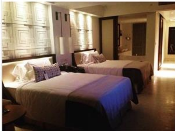
Our room at the Romanos resort