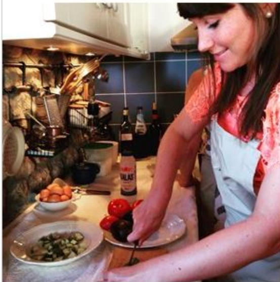
Learning how to cook Greek style