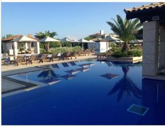
The beautiful pools never feel too busy