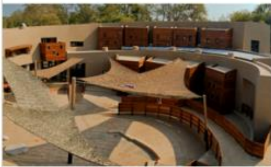
The Sandcastle kids' club