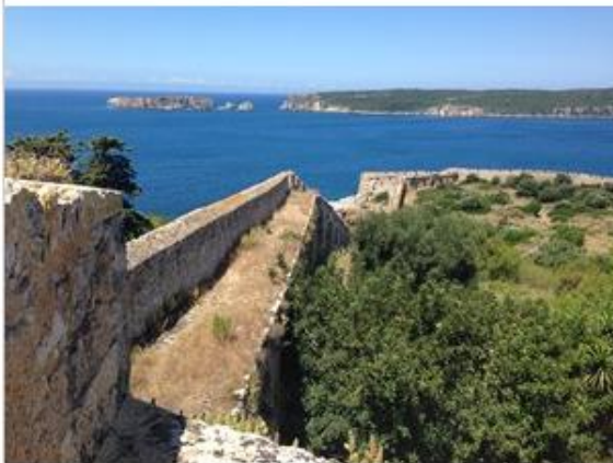
Sail around the bay of Costa Navarino and visit the castle at Pylos

We love the merry go round swingset for toddlers which will dangle their legs in the water as they swing round. There is also three large flume slides for the older kids - including adults. The waterpark is free for guests to use, and half/full days at the Sandcastle can be booked via the concierge for an extra cost.