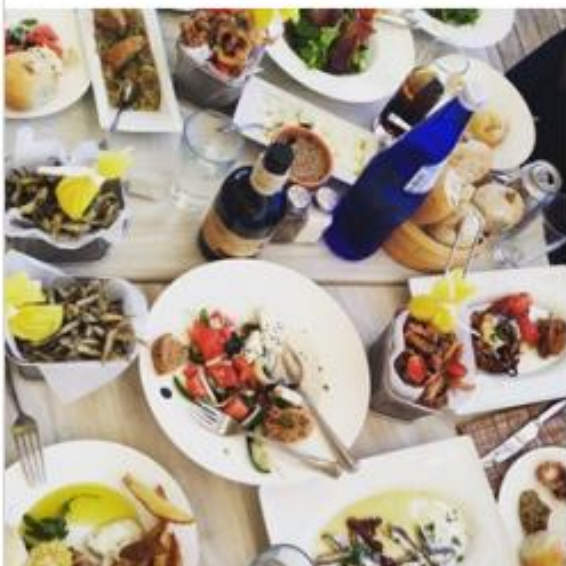
A selection of greek delicacies at Navarino Dunes