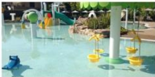
The amazing waterpark!

The best kind of family holidays, in our opinion, are those where the lines between 'activities' for various ages are pleasantly blurred. Travelling with your family should surely mean spending quality time together: not just leaving the children in a bland kids club. Costa Navarino, Greece, is the direct opposite of 'bland', instead bursting with the possibility of adventure. The two hotels within the resort offers the best of both worlds; beautiful grounds, luxurious facilities, family activities and a world class kids club with facilities that even adults will be envious of.