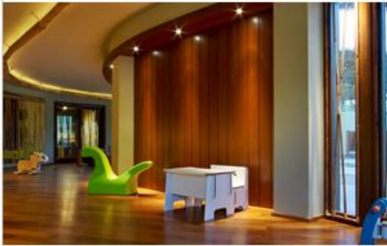
The Sandcastle kids' club