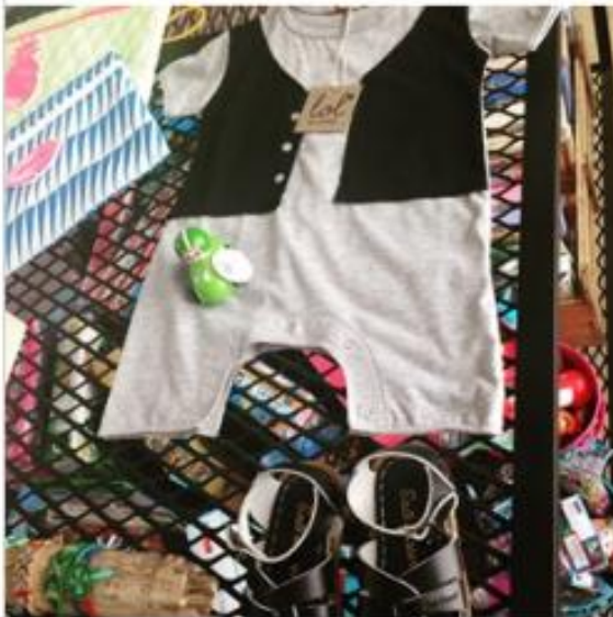
Cute kids' fashion in the shop at the Agora, Navarino Dunes resort