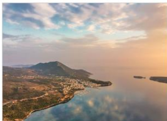
Beautiful Costa Navarino

Costa Navarino is a wonderfully beautiful place, rich in colourful history centuries old and largely untouched. Deep in Messinia, southwest Peloponnese, Greece, it has been preserved thanks to a distinct lack of tourist development. But there is much here for the intrepid family to discover, as well as those seeking an idyllic place to relax and rejuvenate. The first phase of the Costa Navarino development, Navarino Dunes- including a Westin and a Romanos hotel, has been lovingly created to provide a luxurious base from which to learn about local culture, explore the intriguing region and enjoy the incredible natural scenery.