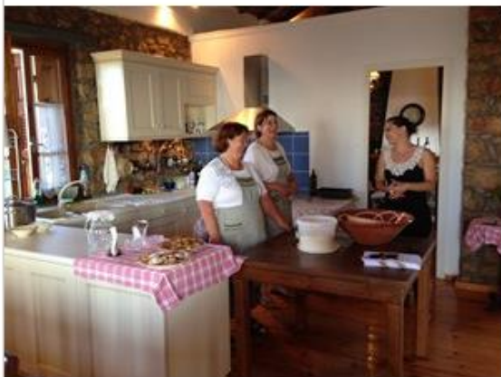
Learning from the professionals!

Souvlaki cafe does what it says on the tin and provides a light lunch and snacks that will suit all tastebuds, even the not so adventurous. Next door is Kayak, the ice cream and frozen yoghurt parlour, which is seriously addictive - we recommend the Ferrero Rocher ice cream. Flame is a grill restaurant, onsite at the golf club house. Here, you can expect piles of quality chargrilled meat, served up with far reaching views of the Peloponnesse mountains. Babouni is the icing on the culinary cake. Located on the beach, the draped curtain ceiling dance in the wind, providing a picture perfect setting that lends itself to a very long lunch. Most of the restaurants offer a la carte dining options or mezze dishes served on platters - a brilliant way to introduce children to local flavours, most of which are fairly plain, yet delicious.