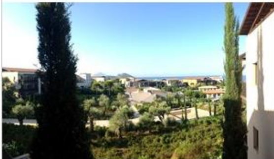
Our view from our balcony at the Romanos