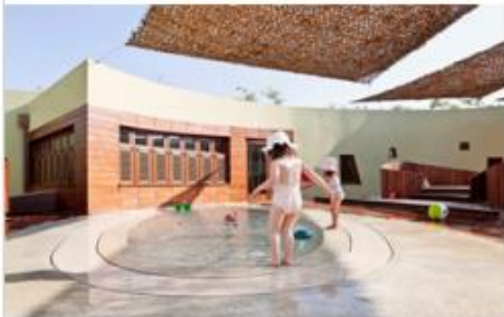
The Sandcastle kids' club