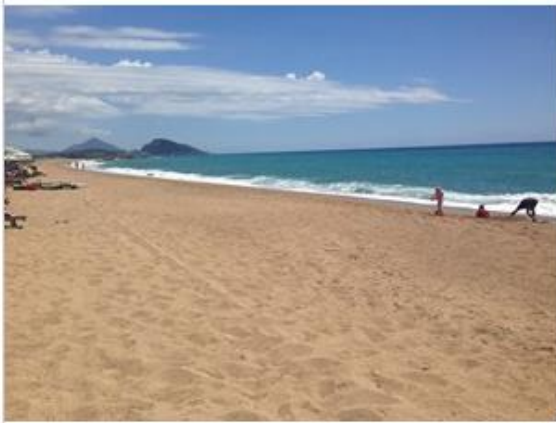
The beach at the Westin and Romanos resorts